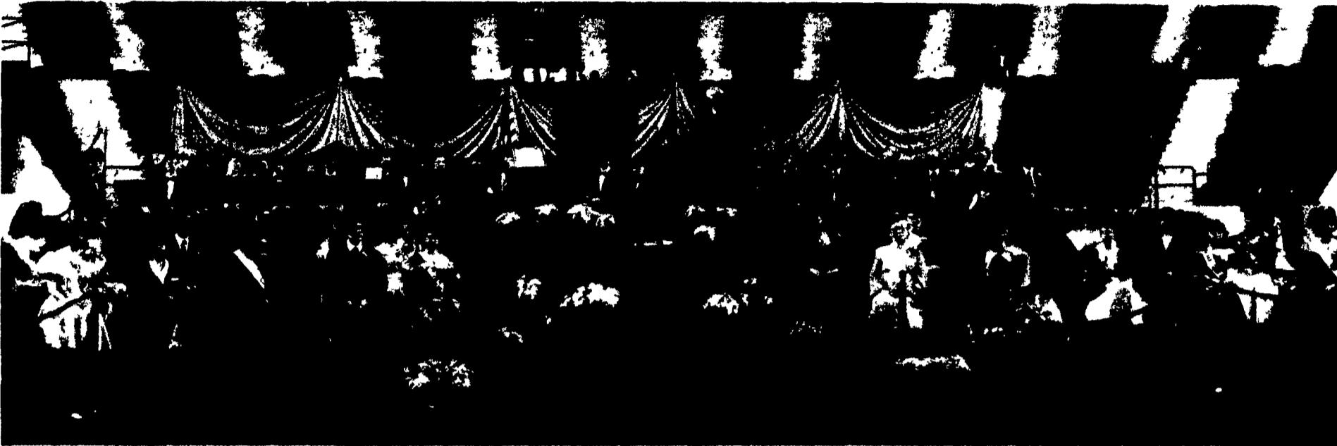
The royalty who represent the many products produced in Pennsylvania near Governor Robert Casey's address at the opening ceremonies of the Pennsylvania Farm Show on Sunday. Record crowds filled the Farm Show complex. Cars sometimes waited in two-mile lines to get to the show. This was the first year the show opened on Saturday and by the show's end on Thursday, record food sales were indicated.

VOL. 37 No. 10 Four Sections Lancaster Farming, Saturday, January 18, 1992 60¢ Per Copy 19.00 Per Year