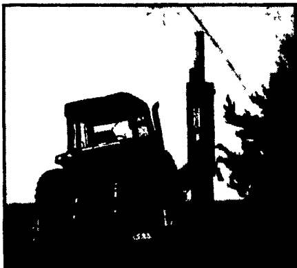
Super Slide w/Post Driver

3 Models Available with augers, diameters from 4"-30" and length from 42"-56"