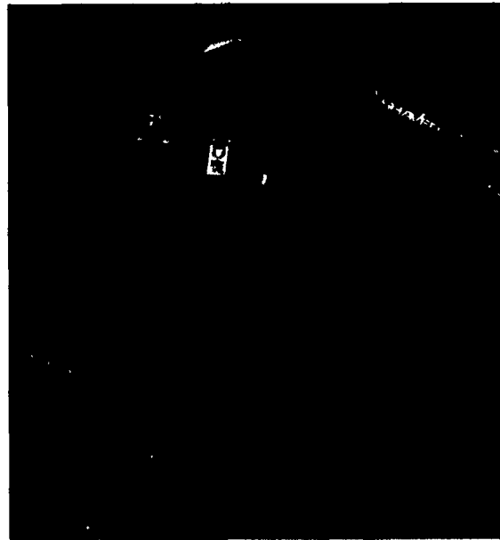
Shaver Post Hole Digger