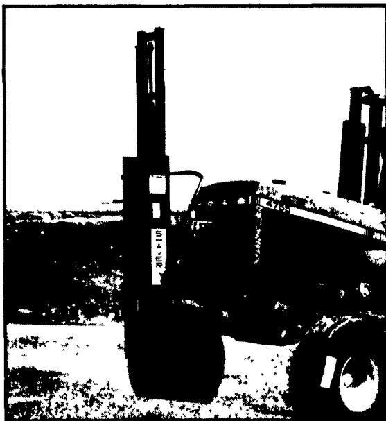
Shaver Post Driver

For fuel economy and better incorporation put a " Buster-Bar " on your chisel plow, disk, field cultivator or plow. The NEW design provides easy adjustment for working or transport positions. The 7/8" diameter teeth bust clods before they dry and harden. Mounted to wing section to fold with unit.