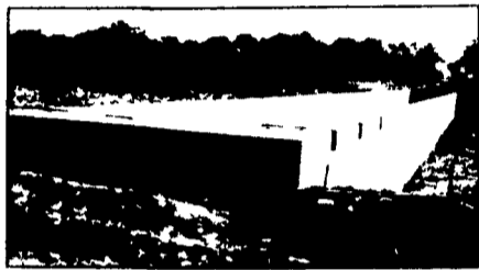
Far Right: 2 Silage Pits In-Barn Manure Receiving Pit