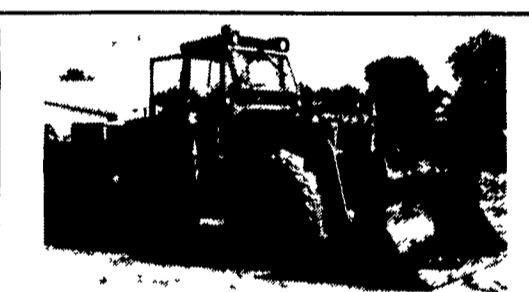
Michigan 55 Series 3 Rubber Tired Loader-Gas- Cab- 4WD- Running Condition, Only $6,500.