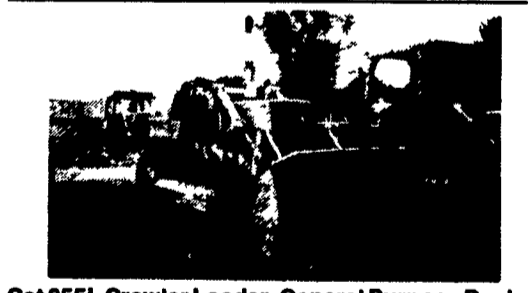
Cat 955L Crawler Loader, General Purpose Bucket With Teeth, Runs Good, Good Undercarriage, Was $22,500, Now $16,500, With ROPS $18,500.