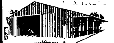
Customized (Many Options Available)