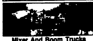
Mixer And Boom Trucks