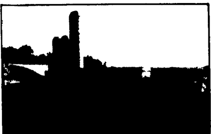
Above-Ground Liquid Manure Tank For Dairy Operation - 235,000 Gal.

17 Years Experience In Pouring Concrete Manure Pits!