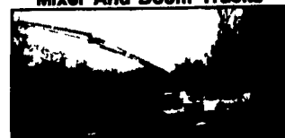
92' Boom Placing Concrete