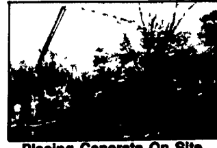
Placing Concrete On Site

Take the questions out of your new construction. Call Balmer Bros. for quality engineered walls.