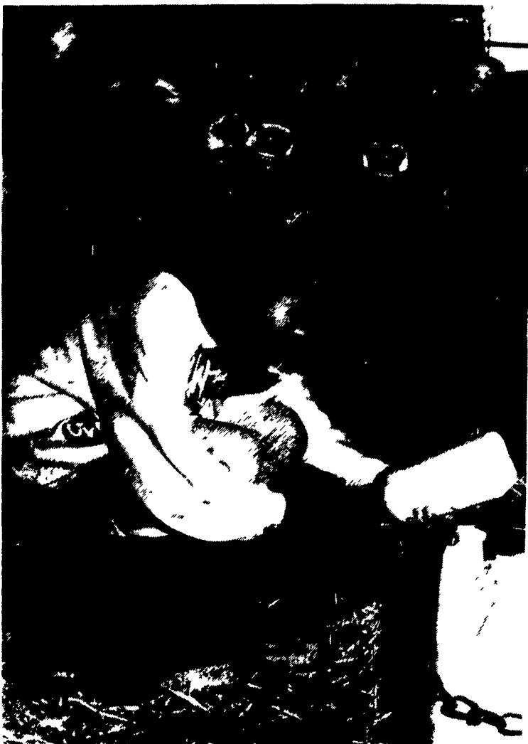
Bottle feeding her first helper calf.