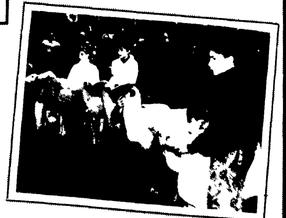
PENNSYLVANIA FARM SHOW Harrisburg, PA