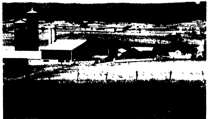
Front Mountain Farm