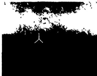
1912 WALLIS BEAR