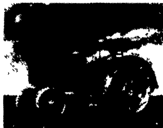
1928 JOHN DEERE GP