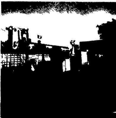
20 Ton P&H Crane 3 Sec Hyd. Boom mounted on a 1968 F.W.D. both engine gas (new front 89), fleet maintenance