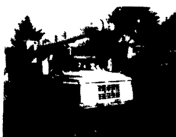
Bucket Truck L-40 ASPLUNDH, single man bucket, 45' working height We also have L-36 Bucket, call for specs