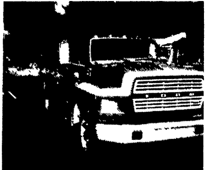
Dump Truck One of several - 1981 Ford F-600, gas, auto. We also have five man cabs with dumps and air compressors