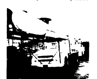
HIGH RANGER 70' working height, two man bucket. this unit was fleet maintained We have service records. Rebuilt engine 5/2 trans on Chevy inspected.