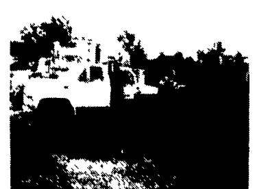
Flat Beds we have large selection of them Knuckle Booms, or Pitman Booms with 11,000 pounds capacity, lift gates, 16'-20' beds all trucks inspected and ready to work