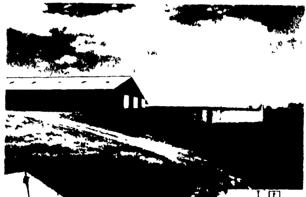
POURED IN PLACE CONCRETE TANKS

Manure management systems to match your kind of livestock, type of manure ...and economics "PLAN NOW for 1991 Construction" Contact us now for late summer & fall construction.