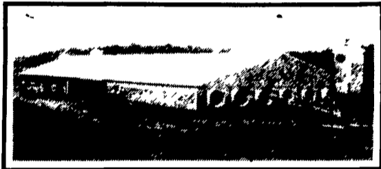
FEEDER PIG OPERATION