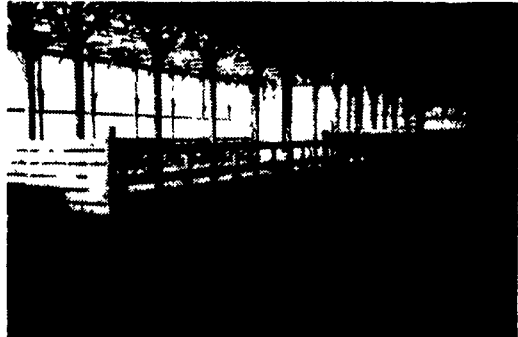
Free-Stall Cow Barn