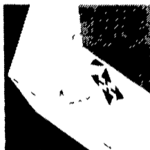
Floating feed gate moves freely in all directions. As hogs eat from trough and bump against the plate its movement efficiently shakes feed from hopper. Vertical movement can be adjusted to accommodate any hog feed.