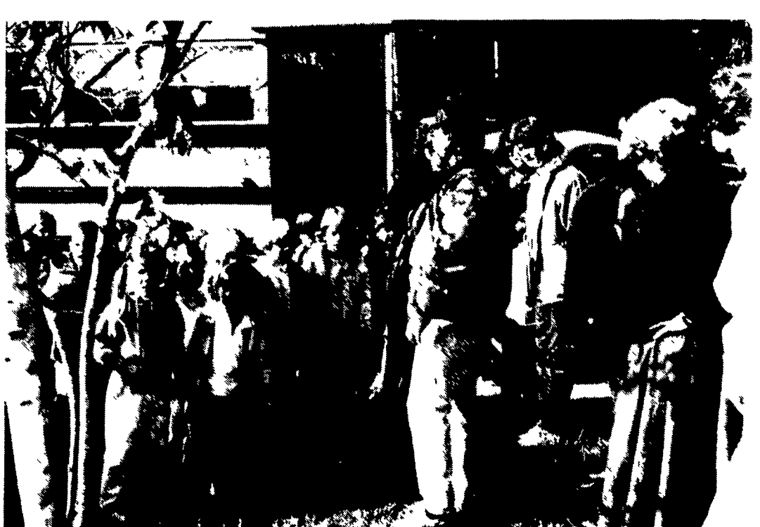
Before the children searched the pumpkin patch, Michael Firestine explained the difference between pumpkins called Happy Jacks and Spookles.