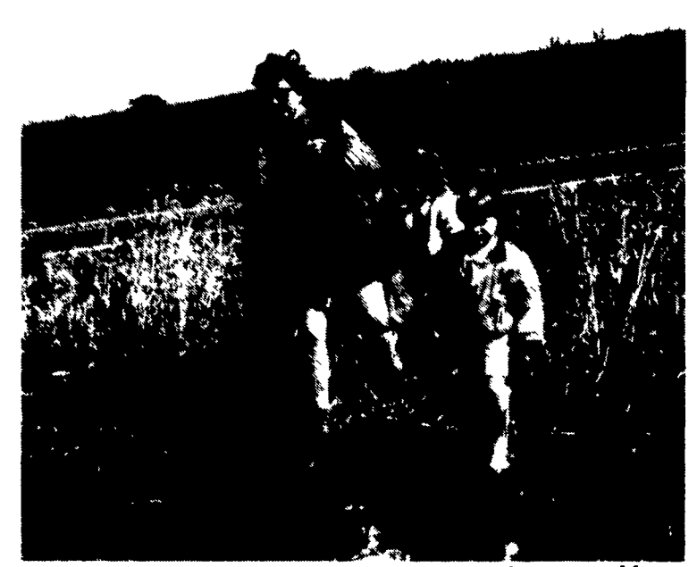
The Pumpkin Lady came to the rescue when pumpkins were too heavy for the kindergarteners to carry.