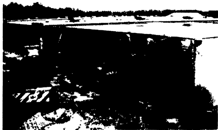
Block Wall Being Restored With Gunite

LET MAR-ALLEN CONCRETE "The Concrete Specialists" SOLVE YOUR PROBLEM As Shown in Picture