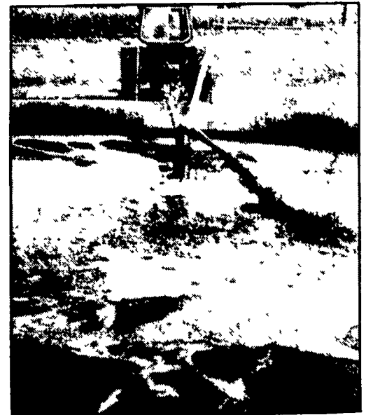
Pit is completely agitated and ready for spreading.