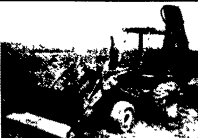
Case 580B Extendahoe $8,700