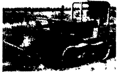
IH 500C Crawler Loader, 4 In 1 $6,000