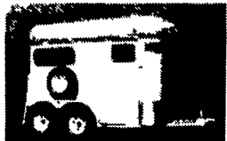
Two Horse Thoroughbred Deluxe

ROCKING "K" STABLES 117 Paradise Lane Ronks, PA 17572 (717) 687-8408 Australrian Saddles and Oilskin Coats, Tack & Horse Supplies