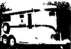
Two horse with 5 ft. dressing room