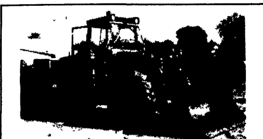
Michigan 55 Series 3 Rubber Tired Loader-Gas- Cab- 4WD- Running Condition, Only $6,500.