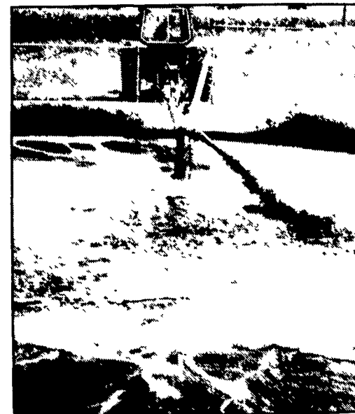
Pit is completely agitated and ready for spreading.