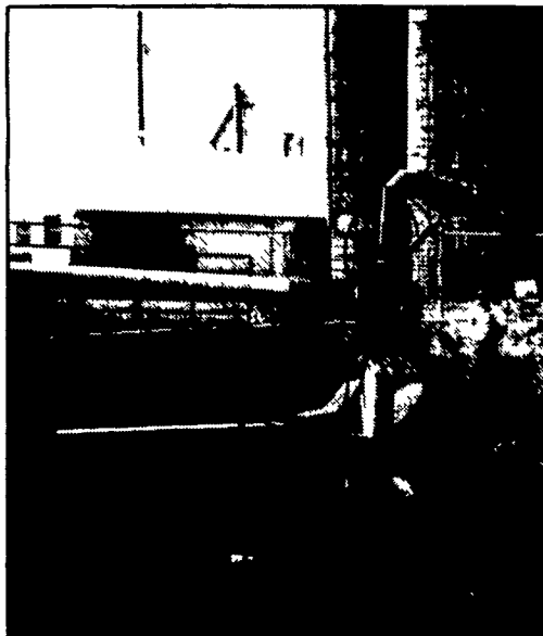
Notice heavy crust on top of pit.