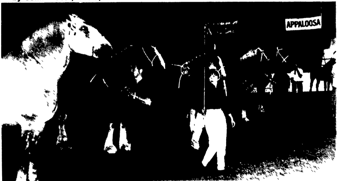
From this class of champions the supreme champion over all breeds was selected.