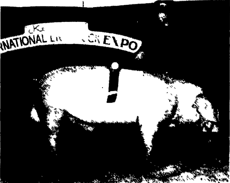
Landrace boar champion went to Grant Lazarus at KILE.