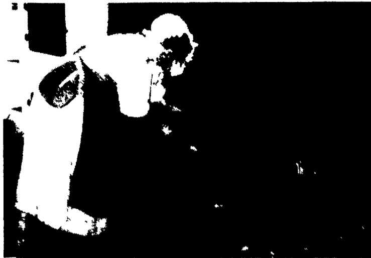
Susan Donoghue-Rick demonstrates open-hearth cooking at the Carroll County Farm Museum. There is vegetable soup in the hanging pot, an apple pie in the dutch oven, sweet potatoes baking in the ashes, apple fritters in the frying pan and Susan is reaching for the 12-pound stuffed turkey. Visitors were treated to samples of apple fritters.

At 4:00 p.m. the Blacksmith Auction will begin. Blacksmith related items antique tools, and items hand-forged by these blacksmiths will be auctioned off