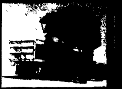
Model 1200/1400 Multi-Purpose Dump Wagon Forage & Grain 550 & 640 Cubic Foot Capacity