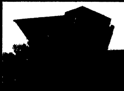
Model 960 and 960F Multi-Purpose Dump Wagon Seed Corn, Sweet Corn & Beets