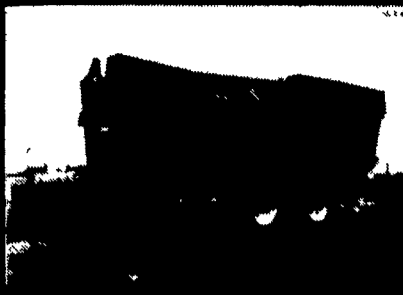
Model 900 Multi-Purpose Dump Wagon Fruits & Vegetables