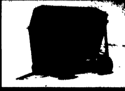
Model 700 Multi-Purpose Dump Wagon Forage & Grain 750 Cubic Foot Capacity