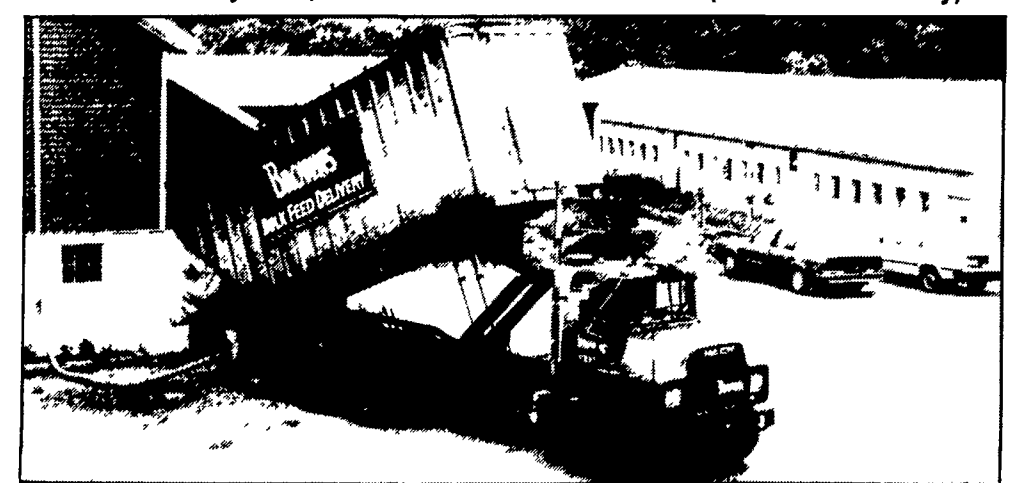
Brown's bulk feed delivery truck visits Foothill Acres.