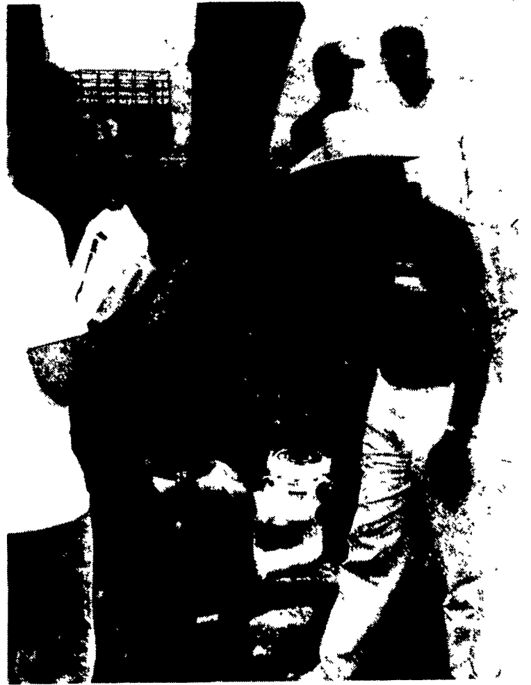
For those who want to draw water from a pond, stream, or other surface supply of water, a sand filter such as this one (40 gallon per minute capacity) for about $400 is necessary. The filter, according to Jarrett, keeps dirt and other contaminants from clogging the emitters from a drip irrigation system.

Those interested in more information about an irrigation system for their farm should talk to their local extension agent.