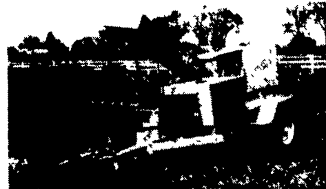
Olathe 16" Brushchipper, 810 Hours, Ford V8 Gas Power, Runs Strong, $5,500.