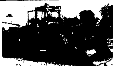
Michigan 55 Series 3 Rubber Tired Loader- Gas- Cab- 4WD- Running Condition, Only $6,500.

HUNDREDS OF CRAWLERS & BACKHOES FOR SALVAGE