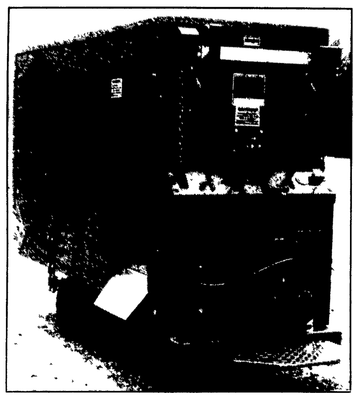
Now available as a rider or walk behind w/optional Electric Start and Electronic Scales

from I.H. Rissler Mfg. at Ag Progress Days Loc. West 4th Street