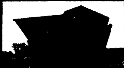
Model 960 and 960F Multi-Purpose Dump Wagon Seed Corn, Sweet Corn & Beets