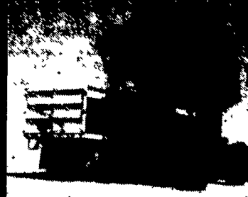
Model 1200/1400 Multi-Purpose Dump Wagon Forage & Grain 550 & 640 Cubic Foot Capacity