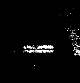
Model 750 Multi-Purpose Dump Wagon Forage & Grain 1000 Cubic Foot Capacity