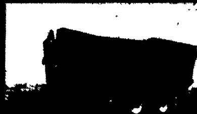
Model 900 Multi-Purpose Dump Wagon Fruits & Vegetables