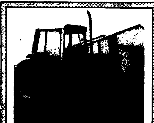
IH 1486 Cab, 3800 Hrs., '80 Model, 20-38 Rubber, Dual PTO $8,900 (717) 532-8926

Lancaster Farming, Saturday, August 10, 1991-F9