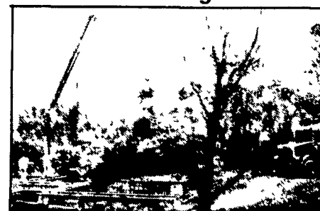
Placing Concrete On Site

Take the questions out of your new construction. Call Balmer Bros. for quality engineered walls.