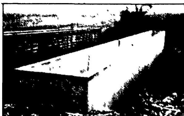
Hog House-Liquid Manure Pit