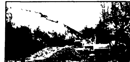
92' Boom Placing Concrete