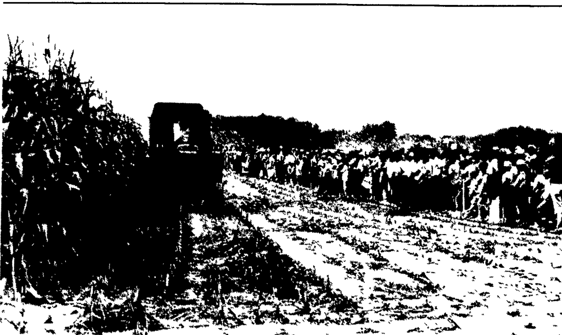
Field demonstrations allow farmers to see competing equipment in action at Ag Progress Days. The event also features tours of research farms and conservation education areas.