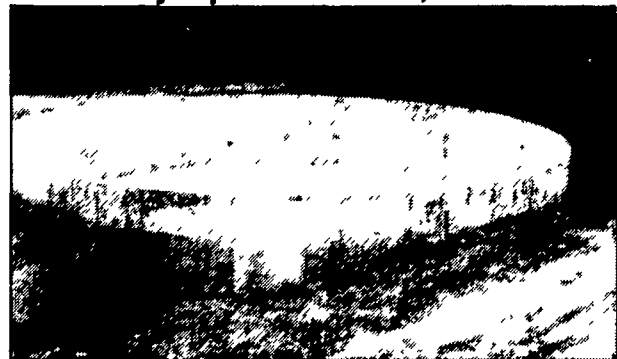
In-Ground Liquid Manure Tank For Hog Operation - 324,000 Gal.

Construction Of In-Ground Liquid Manure Tank- 425,000 Gallons.