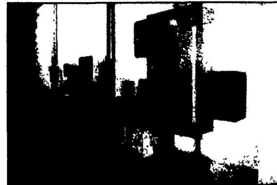
Computerized Environmental Control