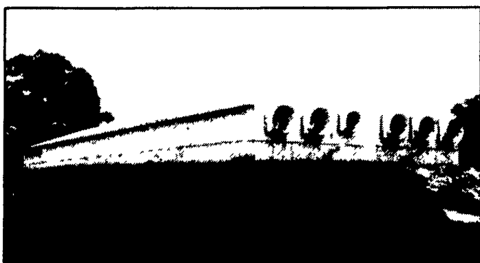
Turnkey Construction By TRI-COUNTY

For Choosing TRI-COUNTY To Construct Your New Finishing Building