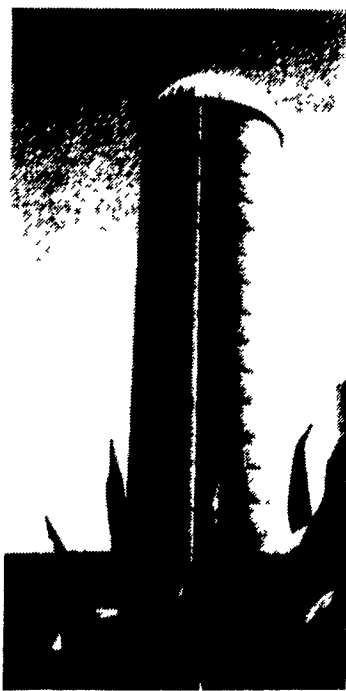
"This is The Kind Of Silo You Need For This Fall's Corn Silage!"