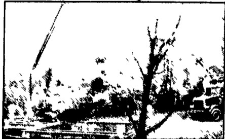
Placing Concrete On Site

Take the questions out of your new construction. Call Balmer Bros. for quality engineered walls.