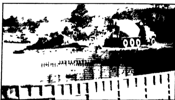
Construction Of Partially In-Ground Liquid Manure Tank - 400,000 Gallons