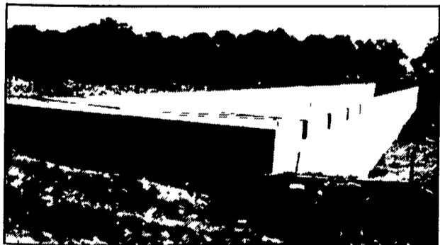
300' Long Manure Pit For Hog Confinement