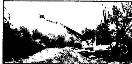
92' Boom Placing Concrete