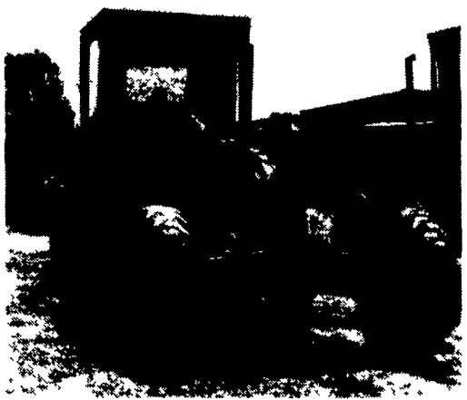
Fiat Allis 100B

May-Co Supply Co., Inc. 430 Biscayne Rd., Lancaster, PA 17601 717-569-1011