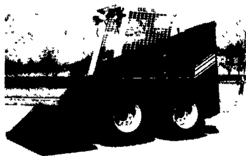
4510/4610/5620/6620 skid loader