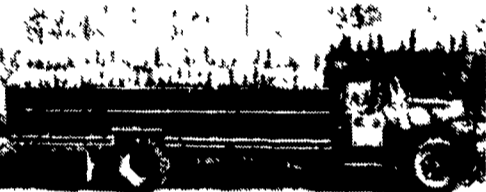
1973 IH 18' Flatbed $3,200

Leonberg Nursery Days 609-234-7590 Eves 609-234-3792