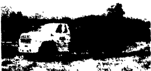
1985 F-700 Ford Truck, Excellent Shape, With New 22' Body. 717-535-5891

1980 Chevy Pickup, loaded, 4 spd., 350, 3/4 ton, 50,000 mi. orig, excellent condition 1975 Chevy Dump C-60, 350, 4+2 trans, new motor, new tires, paint '77 White Tractor w/6V92 Motor, w/10 spd. trans, radial tires '76 Ford 1/2 Ton pickup w/351 Cleveland Motor, new paint, 3-spd. trans. 1979 Chevy Flatbed, 18', 366 motor, 5+2 trans., air brakes, radial tires. (717) 248-9213