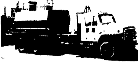
1988 Reinco HG15 Hydro Seeder Mounted On 1979 IH Tandem Diesel Ex. Condition $28,000

CONTRACTOR OUT OF BUSINESS MAKE AN OFFER!