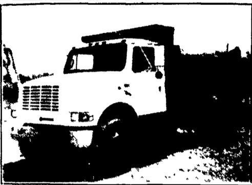
1990 International Dump Truck 466 Dt. Engine, Only 7500 Mi. $29,900 Like New Condition 717-256-3309

R.D. 4, East Farmersville Rd., Ephrata, PA 17522 Located in the Village of Farmersville (717) 354-2150