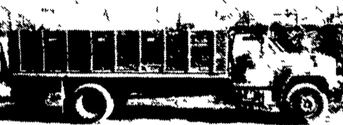
1982 F700 18' Flatbed Detroit Diesel, Liftgate $7,400