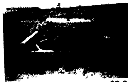
JD 440, GM Diesel, Mechanical Angle $3,000