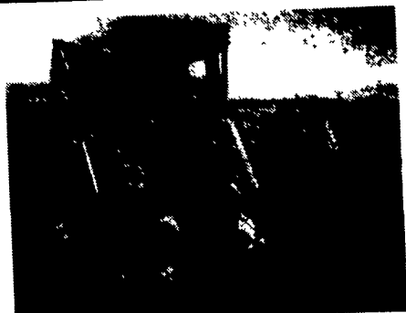
JD 310A, Good Condition..... $9,000