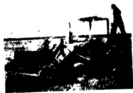
Case 580B, Rebuilt Motor $8,000