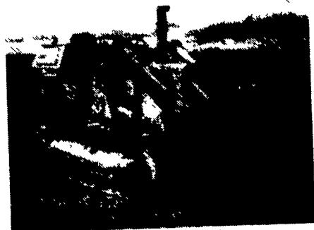
Cat 955K Good Condition $13,000