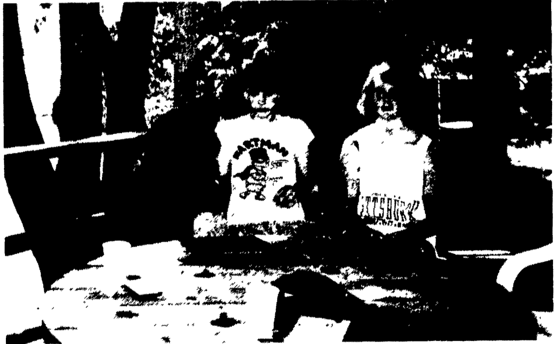
Sarge, the dog, is having trouble sitting still on the porch with Erica and Winter.