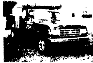
1989 FORD F-350

1 Ton Crew Cab, 350 Auto, PS, PB, Air, AM-FM Cass. St., Camper Special Package, Limited Slip Differential, 9200 GVW, Black & Silver With Matching Fiberglass Topper, 8000 Miles With Bal. of F---, Like New $16,900