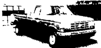
1990 FORD F150 4x4 SUPER CAB

With 8 Ft. Heil Dump, 350, 4 Speed, PS, PB, AM-FM, 12,000 Miles, Ex. Cond. $12,995