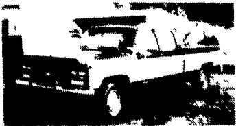
1990 CHEVY SILVERADO 3500

TWO ACRES OF ALL TYPES USED TRUCKS. "IF WE DON'T HAVE IT, WE'LL GET IT"