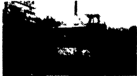
US Government Retired 75 GMC Tractor Big Block V8, 5 Spd/2 Spd, Rear, Air Brakes, PS, 50,000 Maintained Miles, Ideal For Dumps, Hot Shot Tractor Or What Ever First $3,900.00 Takes It

TWO ACRES OF ALL TYPES USED TRUCKS. "IF WE DON'T HAVE IT, WE'LL GET IT"