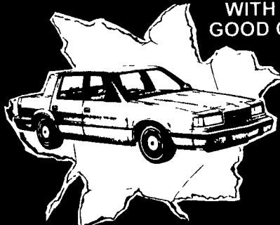
'91 DODGE SPIRIT ORIGINAL LIST PRICE $13,884