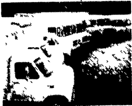
Large Selection of Cube & Step Vans To Choose From, All Different Makes & Sizes, Priced To Your Budget