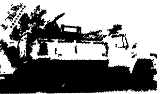
US Government Retires 1982 Int. S1700 Dump 361 V8, 5 Spd/2 Spd, Air Brakes, 10' Power Angle, Snow Blade With Only 2,000 Original Miles.