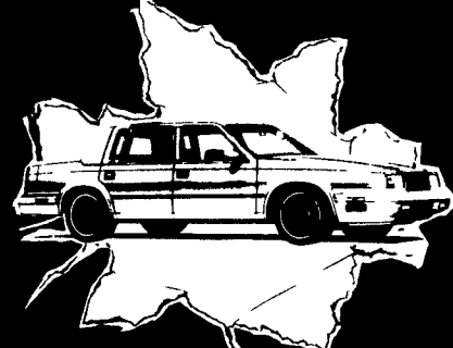
'91 CHRYS. 5TH AVE. ORIGINAL LIST PRICE $24,380