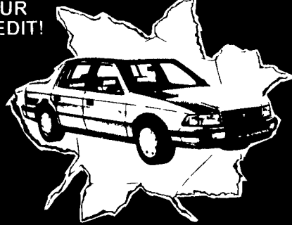
'91 DODGE DYNASTY ORIGINAL LIST PRICE $18,012