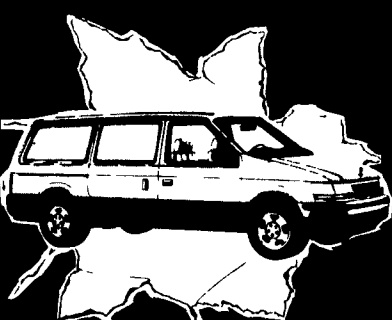
'91 GRAND CARAVAN ORIGINAL LIST PRICE $19,362