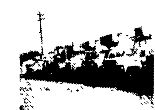
We Got Reefers All Different Types & Sizes To Choose From Starting At $3,900