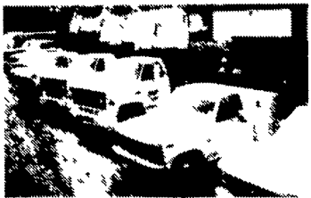
Stake Body Dumps In Good Working Condition, Priced Under $5,000 - While They Last