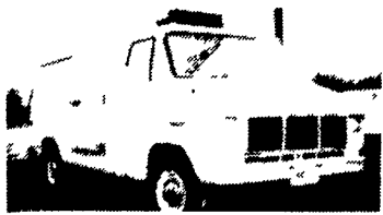
1985 GMC Thermo King Reefer Cargo Van, w/Side Door, 350 V8, AT, PS, PB, 77,000 Miles, Med Temp., Brand New Engine, 3 Yr. 50,000 Mile New Engine Warrantee. Available For Sale Or Lease