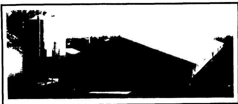
Exterior View - 44'x500' Curtain-Sided Building