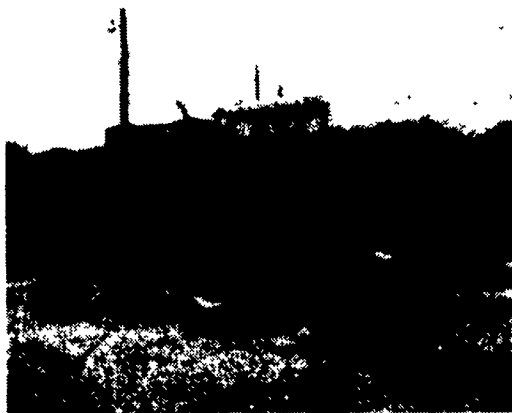
JD 4420 Diesel, 1486 Hrs., 216 Flex Head & Chopper, Good Cond. $23,500