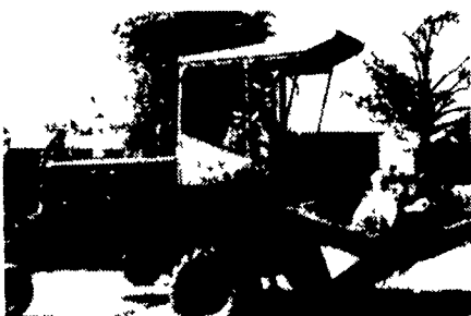
New Holland 1495 self propelled 12' cat, Ford diesel, cab w/air, $12,500 Reduced $11,400 $10,900

Just Announced! 2 Year Warranty On Gehl Round Balers & Mower Conditioners.