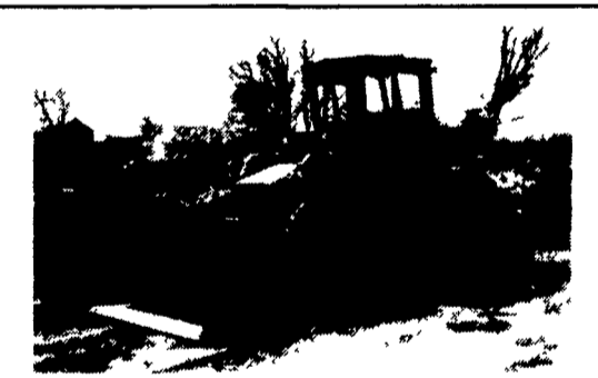
Terex 72-21 Rubber Tired Loader- GM Diesel- Torque Converter- Articulated- Cab-Runs Fair. Only $5,900

Clark 4000 Lb.....$1000 Caterpillar 5000 Lb.....$3900 Clark 8000 Lb.....$5900 White 40 LP.....$5900 JD 480.....$6800 Clark 8000 lb. Gas.....$11,500 Chicken Hawk.....$13,500 Komatsu FG40 1980 8000 Lb. & Triple Mast.....$13,500 Case 586C.....$18,500