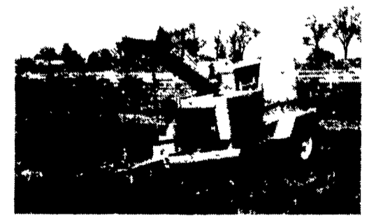
Olathe 16" Woodchipper, Low Hours, V8 Gas Power, Runs Strong. $5,500