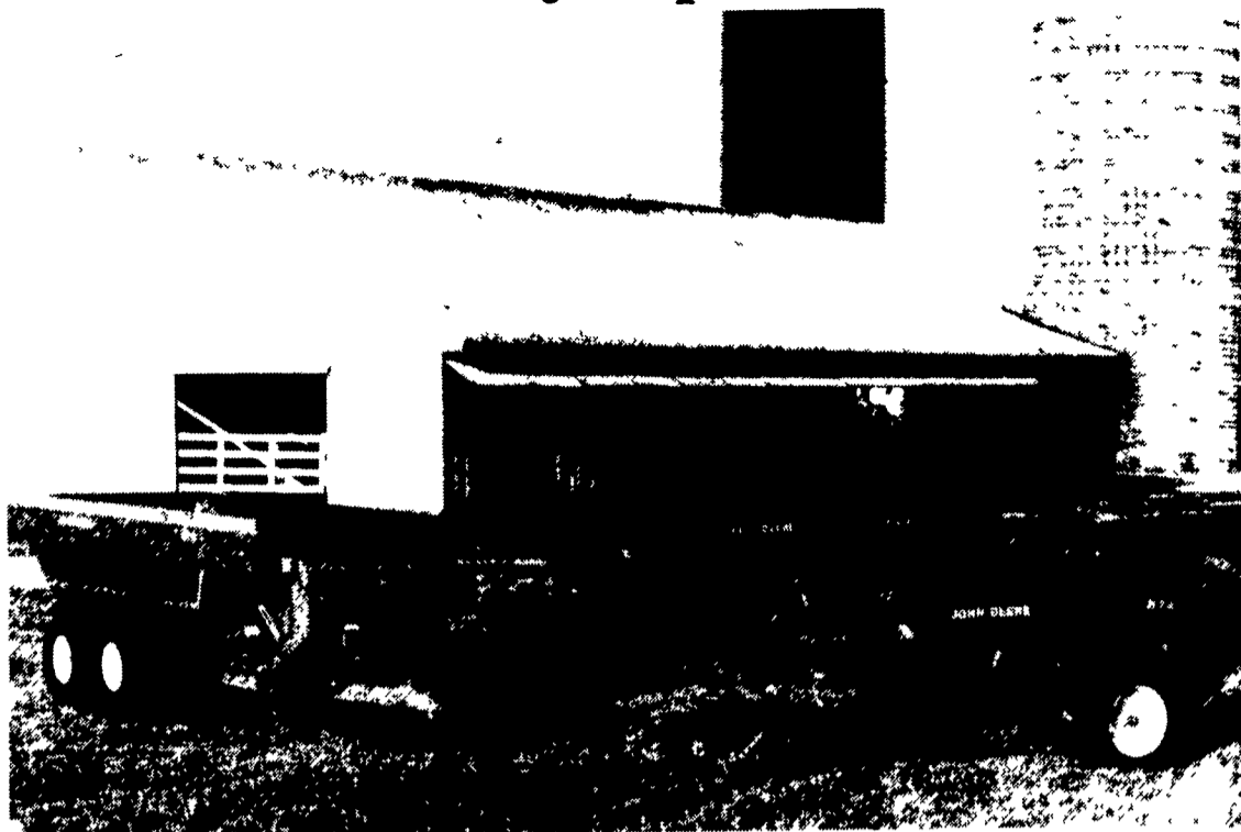
The John Deere 872, 874, and 876 side-delivery spreaders are designed for customers who handle mainly slurry manure. The auger, mounted near the floor of the V-shape tank, can be raised hydraulically when handling semisolid manure to break up bridged material that can form above the auger during unloading. The auger has intermittent flighting that delivers a smooth, steady flow of material to the front expeller.

An optional deflector can be installed on the expeller gate to aid the breakup of small clumps of sticky material for a more even spread pattern. An expeller pan is available to help keep liquids from running under the expeller to the ground during unloading. Other attachments include an expeller corner lid to help retain backspray