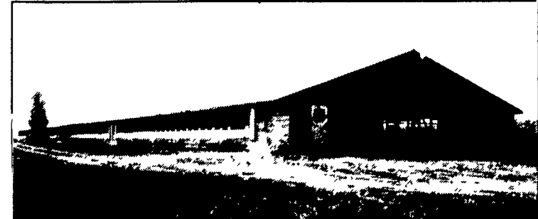
QUALITY TURNKEY CONSTRUCTION