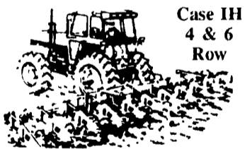
Case IH 4 & 6 Row

Big 5"x7" Frame Don't Miss The Big Discount!