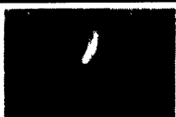
1300 Balanced-Head Mounted Mower

IN STOCK NEW Case IH 3 Pt. Sickle Mower 7 Foot