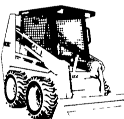
Model 1840 50-hp diesel

BINKLEY & HURST BROS., INC. HAS A UNILOADER FOR YOU! WE ARE YOUR UNILOADER DEALER WITH SERVICE & VOLUME SALES FOR A SUPER DEAL!