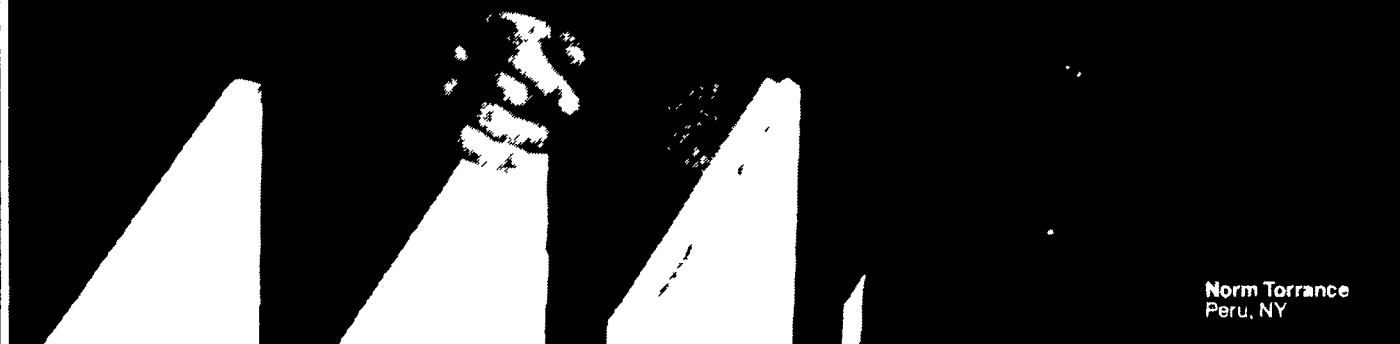
Norm Torrance Peru, NY

"MEMBERSHIP IN DAIRYLEA MEANS... MORE BENEFIT OPTIONS!"