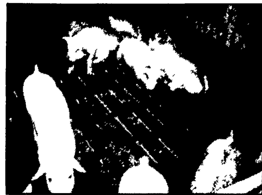
Hog "Waffle Slats" Concrete Hog Penning

The concrete slat with Your Animals Comfort In Mind