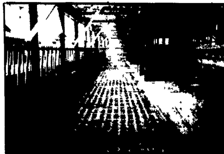
Heifer "Waffle Slats"

The concrete slat with Your Animals Comfort In Mind